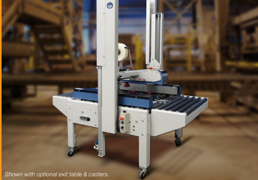
Shown with optional exit table & casters.