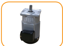
1/3 HP motors for heavy duty usage