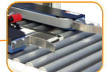
Case retainer in-feed guides