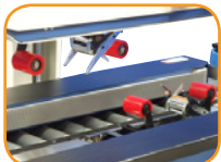
Offset tape heads process 5" high cases