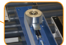
Self-tensioning & tracking side drives simplify belt replacement