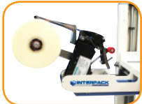
Tip-up tape head simplifies roll replacement