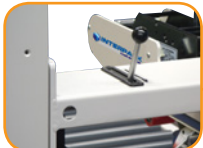
Single handle locks upper head to both columns