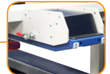
"Floating" upper head for mild overfills