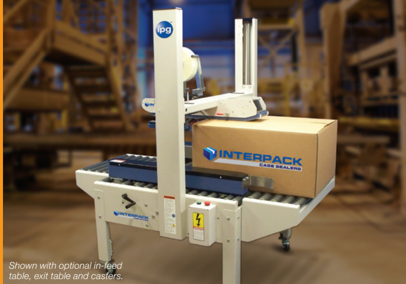
Shown with optional in-feed table, exit table and casters.