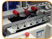
Top & bottom belt drive with belt over roller technology