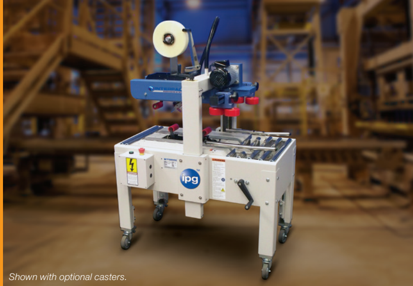
Shown with optional casters.