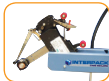
Tip-up tape head simplifies roll replacement