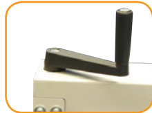
Threaded rod upper head lifting