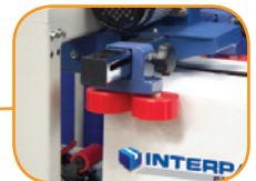
2-wheel top squeezer