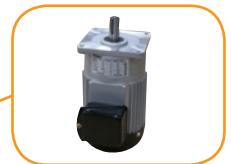
¼ HP gear motors to process up to 65 lb cases