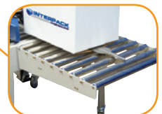
Optional 19" long pack tables available with pack horn