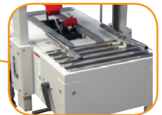
Horizontal self-centering in-feed guides